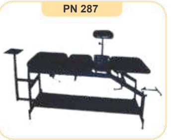
Traction Table 4 Fold