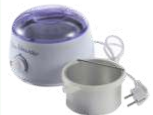
Mini Wax Warmer