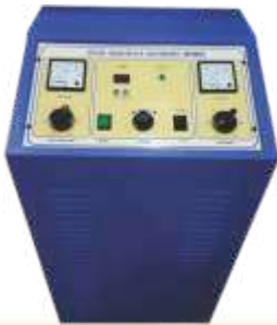
Pulse Shortwave Diathermy 500/1000 W