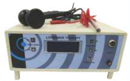
Long Wave Therapy