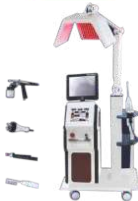
New Multifunction Hair Regrowth Machine