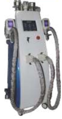
Cyrolysis Slimming Machine