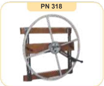
Shoulder Wheel (Wall Mounting)