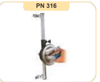
Rotary Wrist Machine