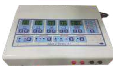
Computerised IFT - 29 Prog.