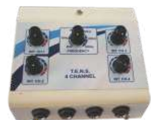
4 CH. Mini T.E.N.S.