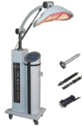
Multifunction Led Machine