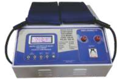
Micro Controller Based Diathermy Pulse & Continuous