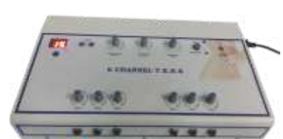
6 Channel TENS