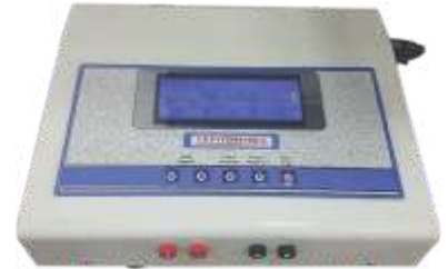
IFT + TENS + MS