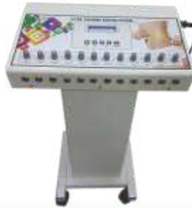
LCD 12 Ch Body Shaping Systems With Trolley