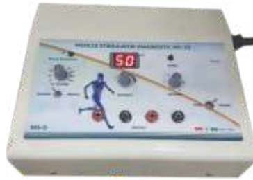
Muscle Stimulator Diagnostic MS-10