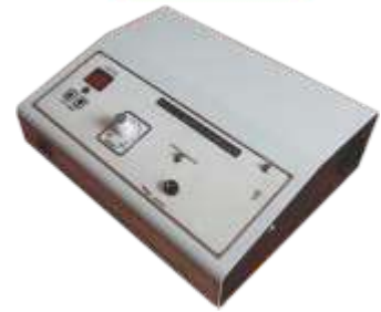
Mole & Warts Remover