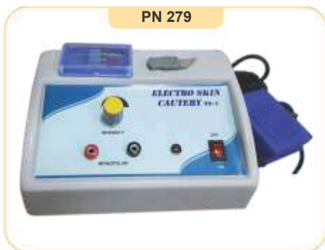
Electro Skin Cautery NS-1