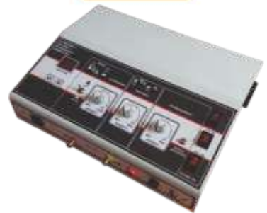
3-In-1 Beauty Equipment