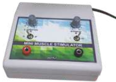
Mini Muscle Stimulator (Plastic Body)