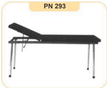
Examination Couch (Metal)