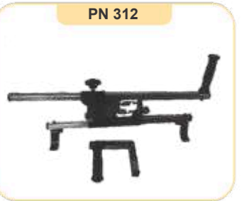
Axial Shoulder Wheel