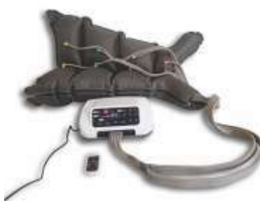
DVT with Remote