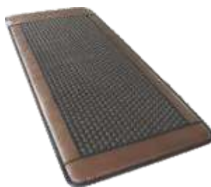
Stone Heat Therapy