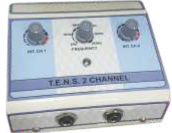
T.E.N.S. 2 CH (Metal Body)