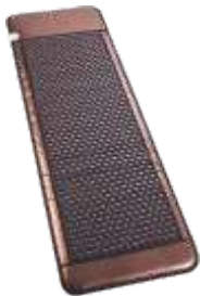
Stone Heat Therapy