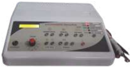
LCD Diagnostic Stimulator