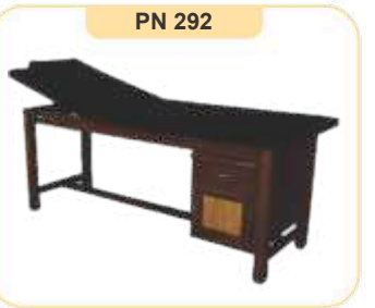
Examination Couch (Wooden)