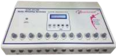
LCD 12 Ch Body Shaping Systems