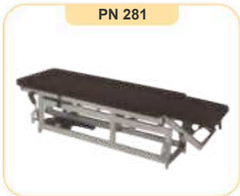
High Low Treatment Table