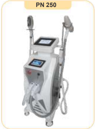
PN 250 HOT OPT SHR IPL + Yag Laser + Cooling RF