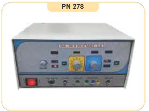
ESU - 250 W Solid State - UB