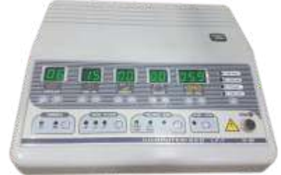
Computerised IFT - 29 Prog. (Fiber Body)