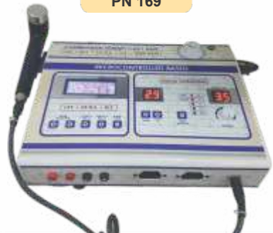
Combination Therapy 5-In-1 Unit IFT + MS + TENS + US + Deep Heat