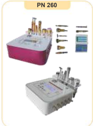
PN 260 Needle Free Mesotherapy Face Machine