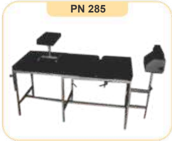
Traction Table 2 Fold