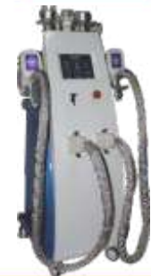
Cyrolysis Slimming Machine