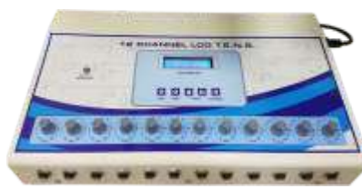
LCD 12 Channel TENS