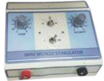
Mini Muscle Stimulator (Metal Body)