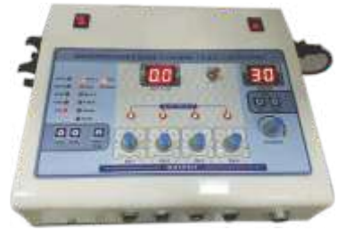
Microprocessor Based 4 Channel TENS + Ultrasonic