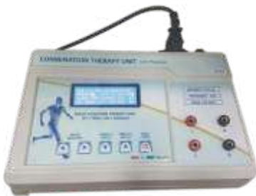
Multi Function Therapy Unit IFT + TENS + MS + Russian