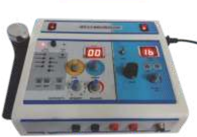
IFT + 1 Mhz US Combi