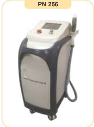
PN 256 Diod 802 Hair Removal