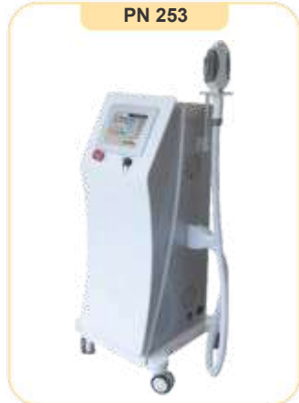
PN 253 OPT SHR IPL Machine