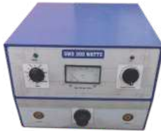
500 Watt SWD Portable