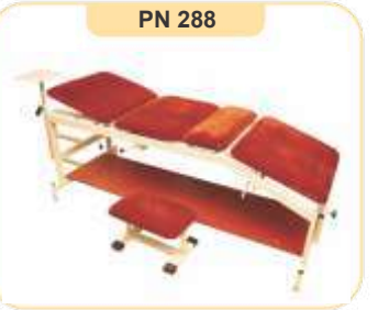
Traction Table 4 Fold