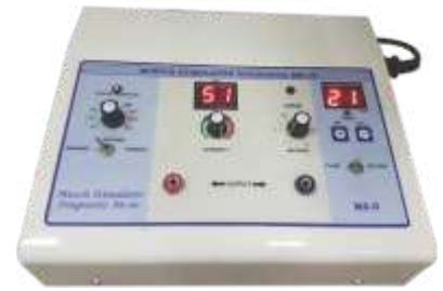
MS-10 + Timer