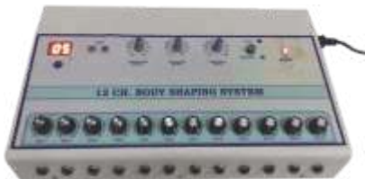
12 Ch. Slimmer Manual