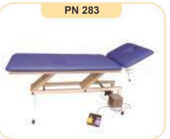
High Low Treatment Table