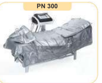
Heat Blanket + Compression Therapy