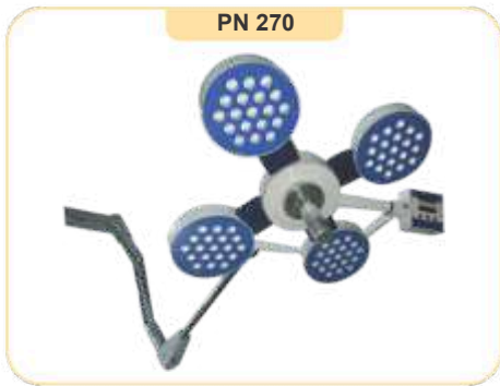
OT Light 4 Dome