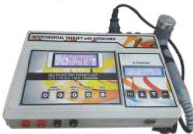
Interferential Therapy with Ultrasonic