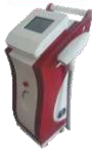
ND YAG LASER