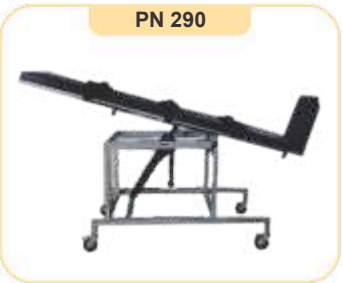
Tilt Table (Manual)