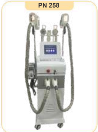
PN 258 2017 New Hot Sale Cryolipolysis Machine