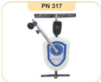
Motorised Shoulder Wheel