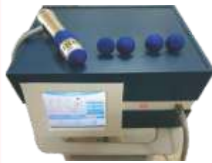
Physiotherapy Shockwave Therapy