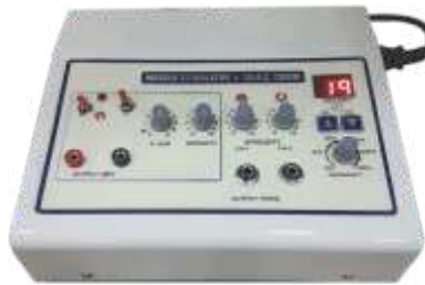
Muscle Stimulator + TENS Combi