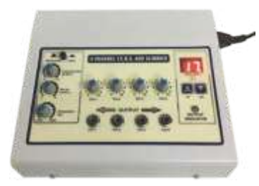
4 Channel TENS