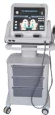
Hot Hifu Machine (Medical Version)