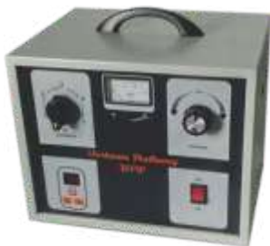
300 Watt SWD