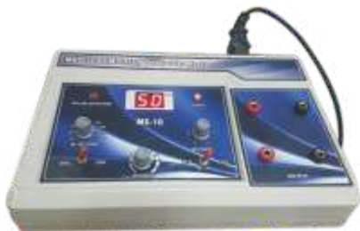
Muscle Stimulator Diagnostic MS-10