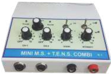
TENS + MS Combo