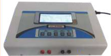
70 Prog. Interferential Therapy