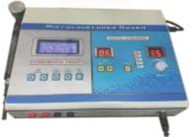
Microcontrolled Based Interferential Therapy