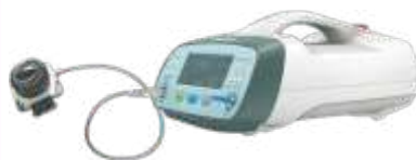
Laser Therapy (Imported)