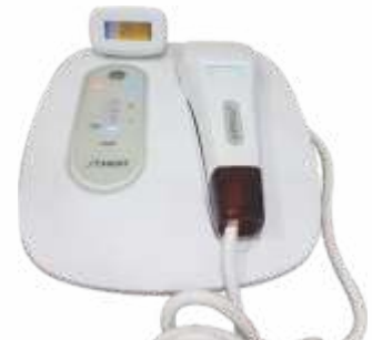
SHR + HR