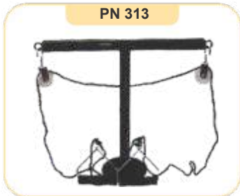
Ball Medicine Set (With Cabinet)