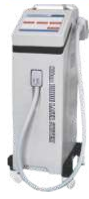
810nm Diode Laser Hair Removal & Skin Rejuvenation Machine