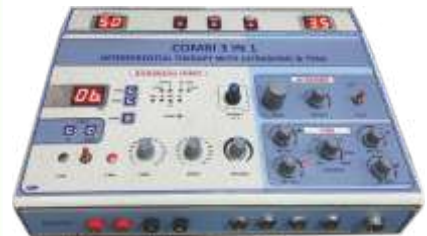
IF T+US+TENS Combination 3-IN-1