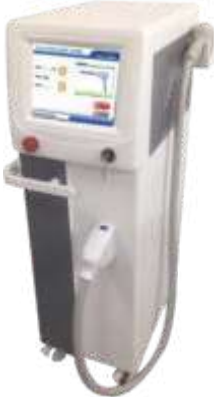
810nm Diode Laser Hair Removal & Skin Rejuvenation Machine