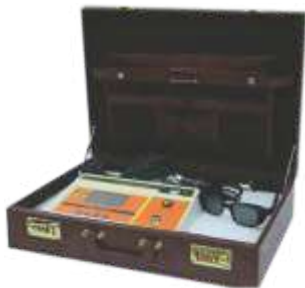
Laser Therapy (Indian)