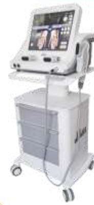
Medical Hifu Face & Body Slimming