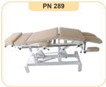
Traction Table 4 Fold