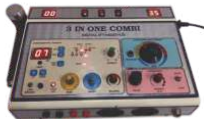
IF T+HEAT+US Combination 3-IN-1