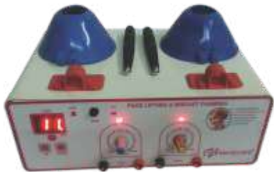
Face Lifting & Breast Firming