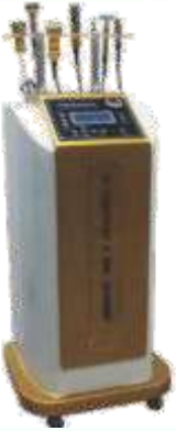
Meso Therapy Machine