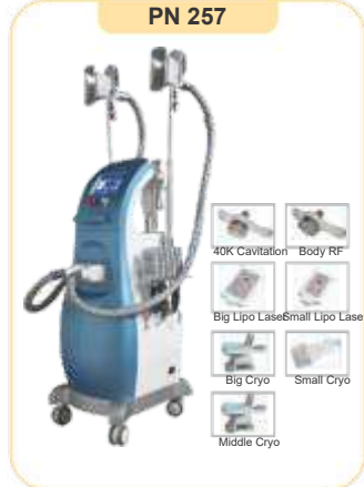
PN 257 Hot Sale Cryolipolysis Machine