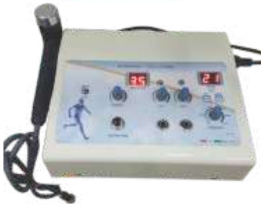
Ultrasonic + TENS Combi