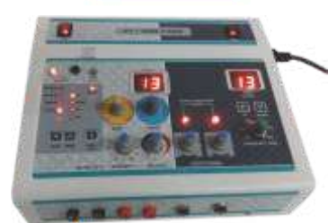
IFT + TENS Combi