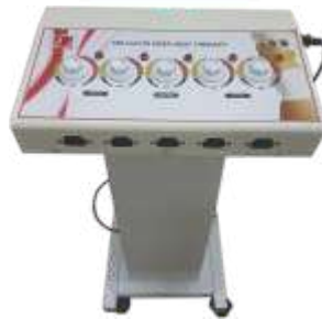
Cellulite Deep Heat Therapy With Trolley