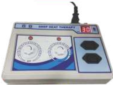
Deep Heat Therapy