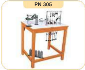
Hand Exerciser Table