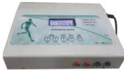
LCD Interferential Therapy 125 Prog.