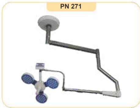
OT Light 3 Dome