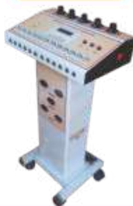
Slimming Studio 3-in-1 Body Shaper + Deep Heat + Vacuum