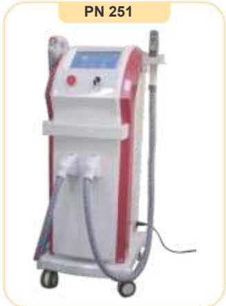
PN 251 Double OPT IPL Machine