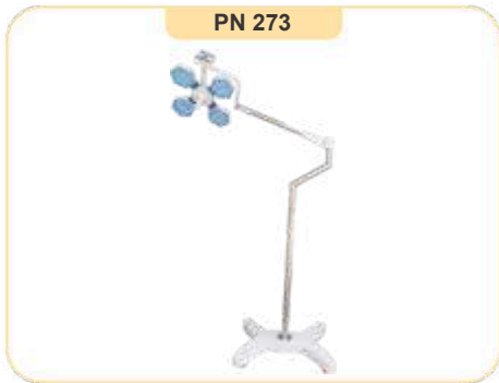
OT Light 4 Dome