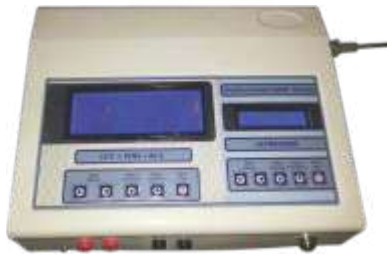
I.F.T.+TENS+M.S. 4 In 1 Combo