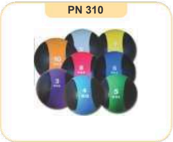
Ball Medicine Set (With Cabinet)