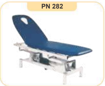
High Low Treatment Table