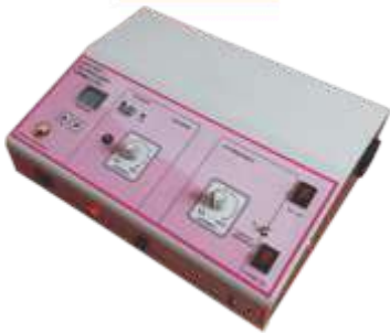
2-In-1 Beauty Equipment