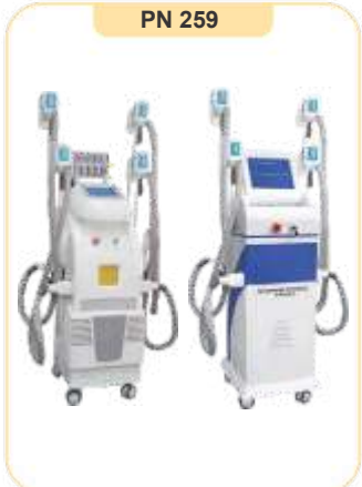
PN 259 Latest 4 Cryolipolysis Lipo Laser Cavitation