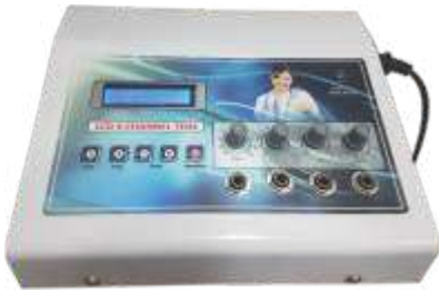
LCD 4 Channel TENS