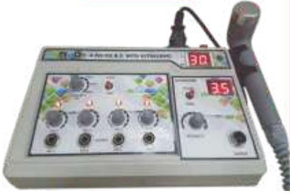
4 Ch TENS+US