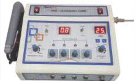
2-In-1 TENS + US