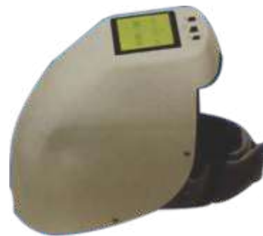
Pain therapeutic Device (Knee & Shoulder)