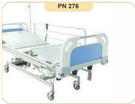
Hospital Patient Bed