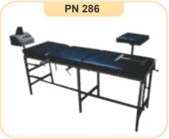
Traction Table 3 Fold