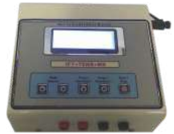
3 In 1 Mini Combo