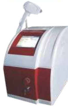
810nm Diode Laser Hair Removal Skin Rejuvenation Machine