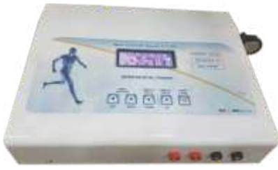
LCD Interferential Therapy 70 Prog.