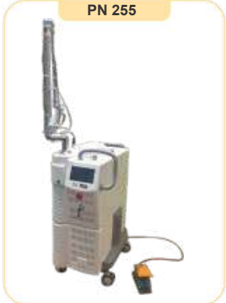
PN 255 Co2 Fractional Laser & Vaginal Tightening Machine