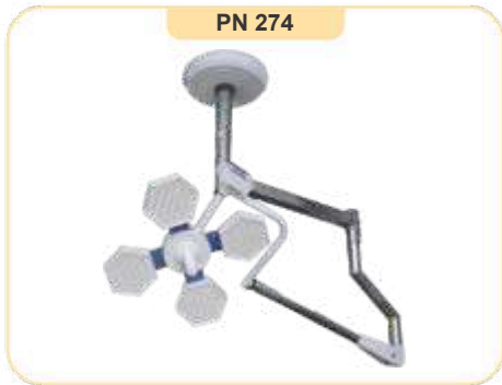
OT Light 4 Dome