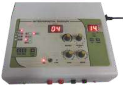
Interferential Therapy (Manual)