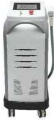
Diod Laser 808 Hair Removal Machine