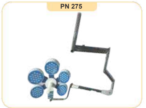
OT Light 5 Dome