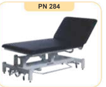
High Low Treatment Table