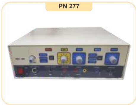
ESU - 400 W Solid State - UB