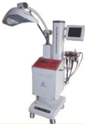
Led + Skin Analyzer + Face Care Machine