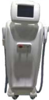
IPL With Double Handle