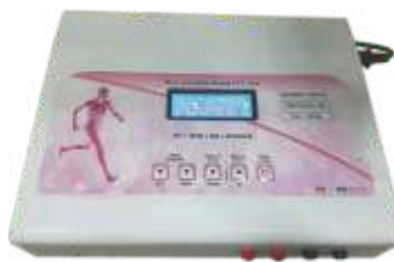
IFT + TENS + MS + Russian