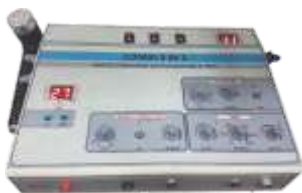
MS+US+TENS Combination 3-IN-1