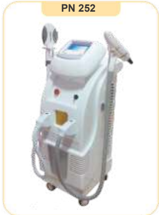
PN 252 2015 New OPT & IPL+ Yag Laser Machine