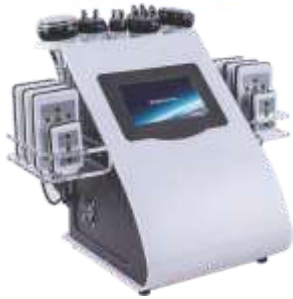
Portble Cavitation Lipo Laser Machine