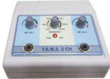
T.E.N.S. 2 CH (Plastic Body)