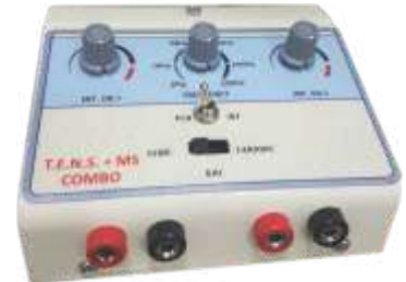
Mini MS + TENS Combi (Metal Body)