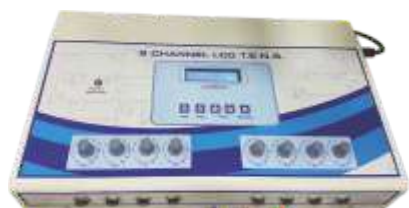
LCD 8 Channel TENS