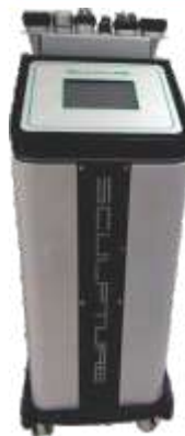
Cavitation Lipo RF Vertical 5-in-1