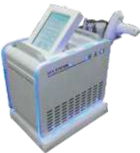
Latest Bubble Beauty Machine