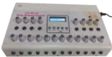
LCD 20 Ch Body Shaping Systems