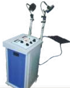
Shortwave Diathermy 500W with Disc Electrode