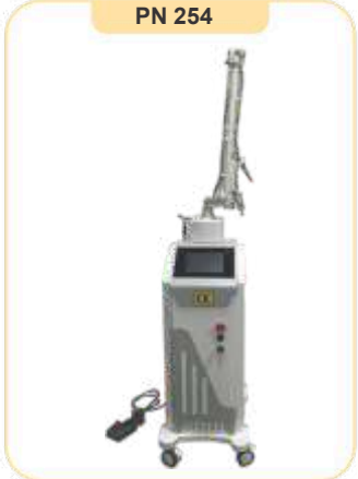
PN 254 Fractional Laser Machine