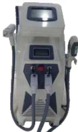
Combination Hair Removal & Tattoo Removal with double screen