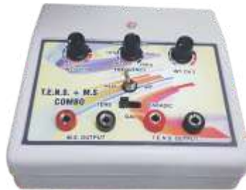
Mini MS + TENS Combi (Plastic Body)