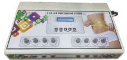
LCD 8 Ch Body Shaping Systems