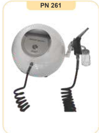
PN 261 Mini Omega Injection Sprayer Machine