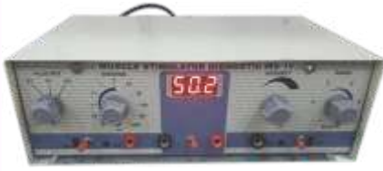
Muscle Stimulator Diagnostic MS-10