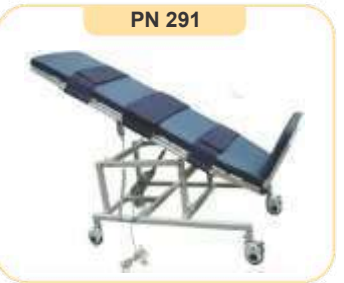
Tilt Table Motorized