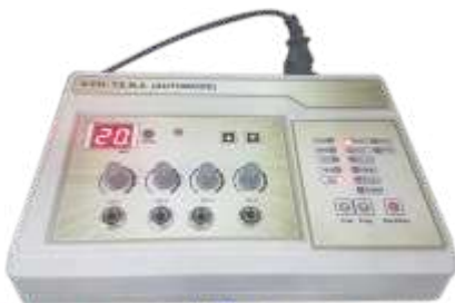
4 CH. T.E.N.S. (Automode)