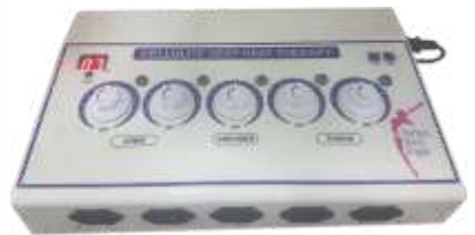
Cellulite Deep Heat Therapy