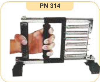
Finger Grip Exerciser