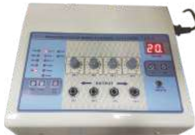
Microprocessor Based 4 Channel Auto Mode TENS