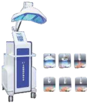
2017 X7 Led & Skin Care Machine