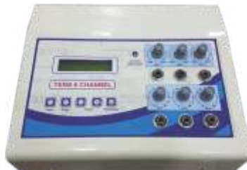
LCD 6 Channel TENS