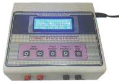
Compact IFT with 70 Program