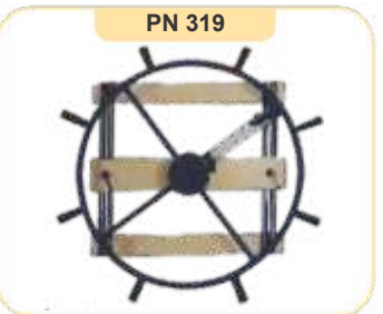
Nautical cum Shoulder Wheel (Wall Mounting)